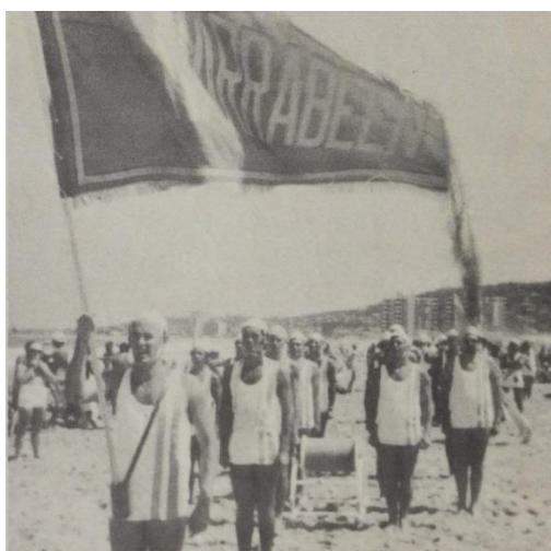
Narrabeen Beach March Past Team