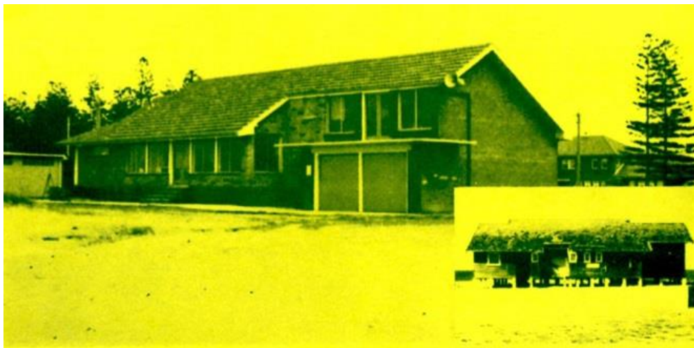
New Narrabeen Beach SLSC – 1971