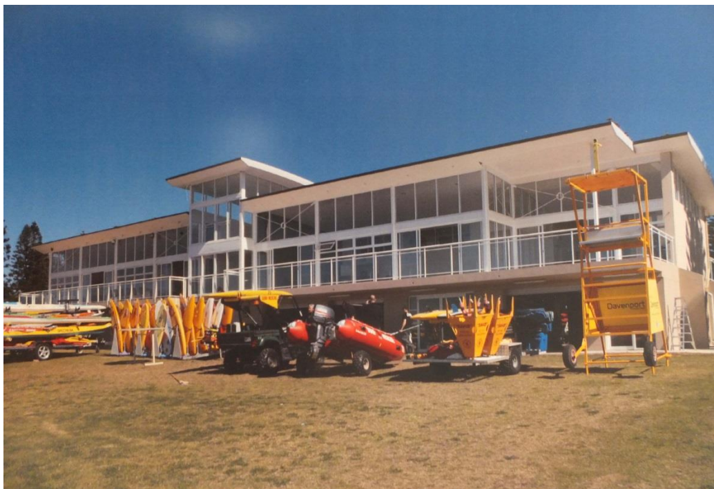
New Narrabeen Clubhouse