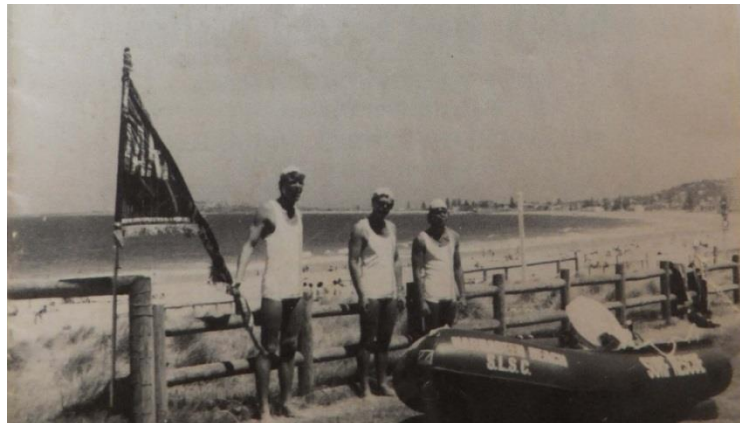
Narrabeen Beach lifesavers with the new IRB